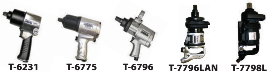
T-6231 T-6775 T-6796 T-7796LAN T-7798L

Wide variety from lightweight 1/4" drive up to Super Duty 1-1/2" drive that produces up to 3,000 ft/lbs of torque