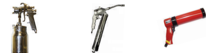
T-7007N Spray Gun T-3010 Grease Gun T-7618 Caulking Gun

Taylor Pneumatic offers an assortment of specialty tools made for wide range of applications