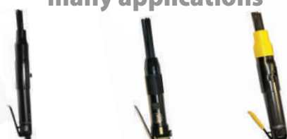
T-7356 T-6356 T-6125 Replacement needles available

All steel construction-chipping concrete and brick, & rust removal-many applications