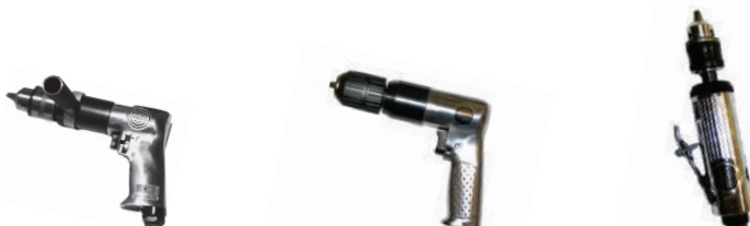
T-7788HR T-6768HRK T-7757D

Quality drills for production use-3/8", 1/2" and 5/8" chuck sizes available