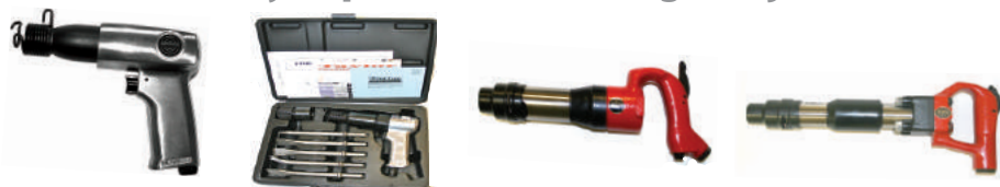
T-7111 T-7121K T-#2 T-#34B