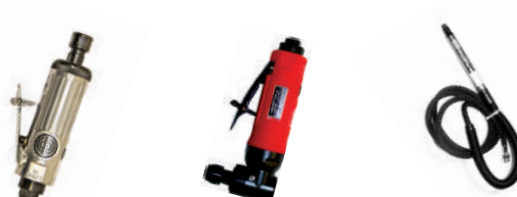
T-6757R T-8859R T-7402

Powerful lightweight & easy to use-perfect for cleaning polishing & deburring